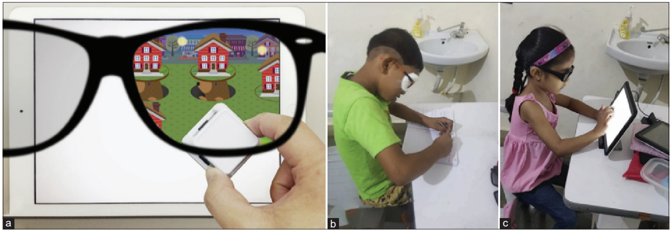
Figure 1: Photographs of the treatment methods. The images depict the appearance of the Occlu-tab (a), eye-patch treatment (b), and Occlu-tab treatment (c). For the Occlu-tab treatment, the game can only be viewed through the right (amblyopic) eye. Both eyes can always see the user's fingers, Tangi block, and any object in the peripheral visual field, such as the edge of the tablet on the tabletop